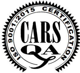
Diagram 1 The Certification Seal

Where you have any doubts as to the use of the Accredited Certification Seal, or you wish to use the Seal in any other manner not described in this Supplement, please contact us to discuss and obtain our approval prior to use.