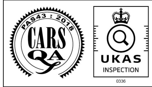
Your Certificate number