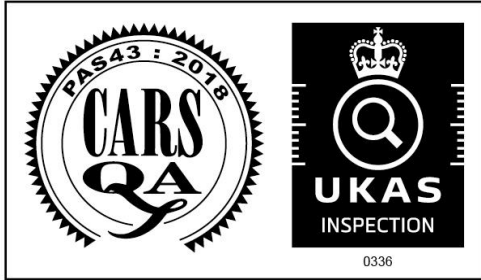
Your Certificate number