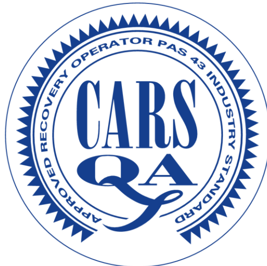
Diagram 1 The Certification Seal

Where you have any doubts as to the use of the Accredited Certification Seal, or you wish to use the Seal in any other manner not described in this Supplement, please contact us to discuss and obtain our approval prior to use.