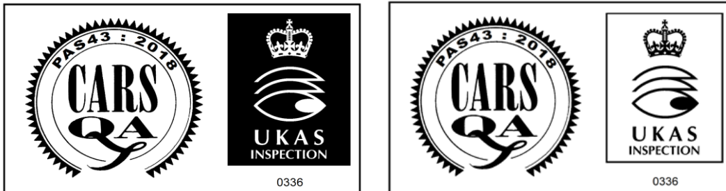
Your Certificate number centre under the box - Ditto