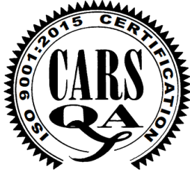
Diagram 1 The Certification Seal

Where you have any doubts as to the use of the Accredited Certification Seal, or you wish to use the Seal in any other manner not described in this Supplement, please contact us to discuss and obtain our approval prior to use.